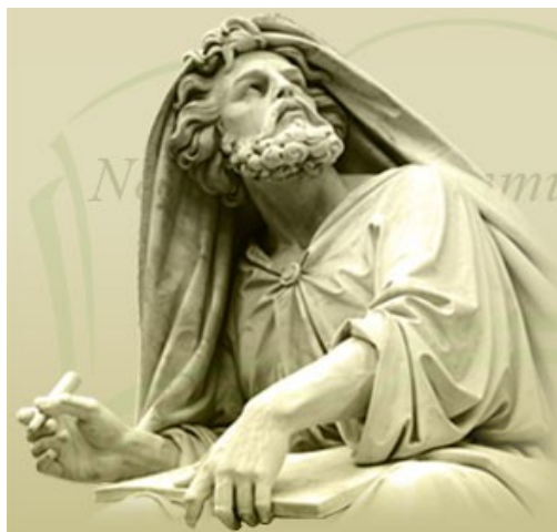
Familiar face? You've probably seen him on the new library website.

Several databases have undergone major re-designs and enhancements. The primary recipient of complete redesign is Gale's Resource Center family. Opposing Viewpoints In Context , Science in Context and Biography in Context all replace their Resource Center counter-